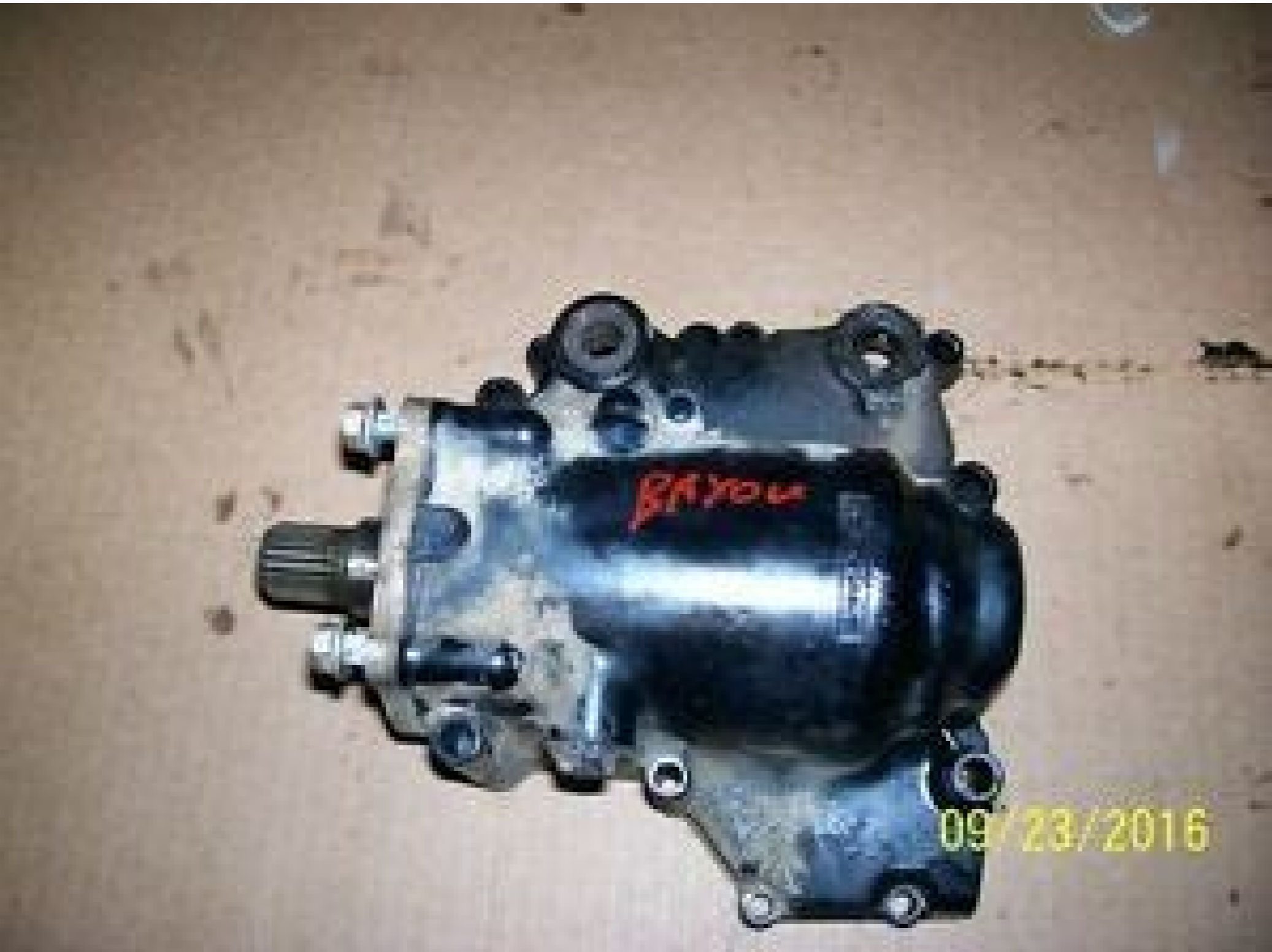
1994 kawasaki bayou 300 manual.